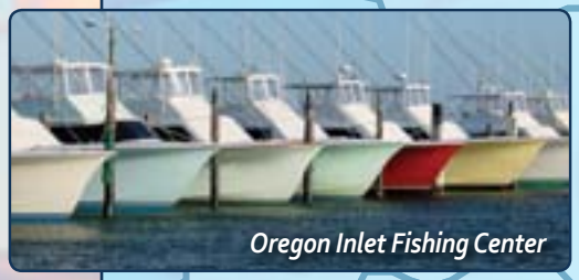
Oregon Inlet Fishing Center