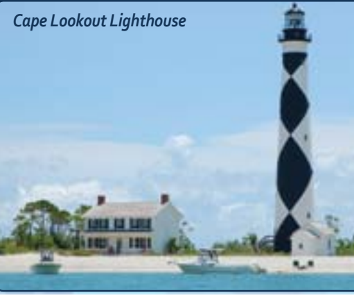
Cape Lookout Lighthouse