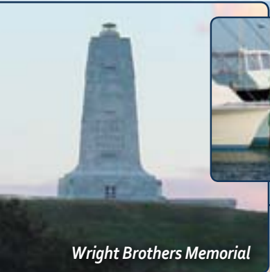
Wright Brothers Memorial