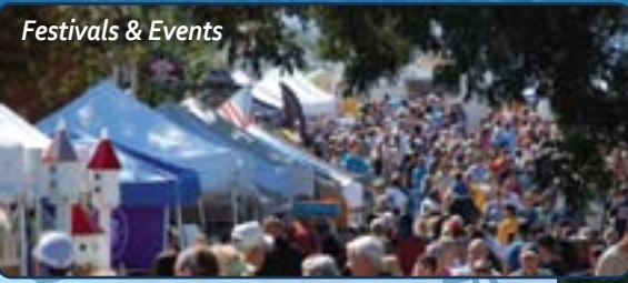
Festivals & Events

From the Outer Banks to Roanoke Rapids, from the Dismal Swamp to the Pamlico Sound, this part of North Carolina has many attractions to tempt visitors and locals alike. With two aquariums, three wildlife refuges, the Albemarle Sound, and Jockey's Ridge, there's always something fun to do. Visitors won't want to miss the Wright Brothers Museum, the Roanoke Island Festival Park, the Core Sound Museum, Cupola House, and the Lost Colony outdoor theatre. Light houses abound and ferries make traveling to each destination an adventure. Stay in one of the area's B&B's and try scuba diving North Carolina's famous shipwrecks just off the coast...and that's all just for starters!